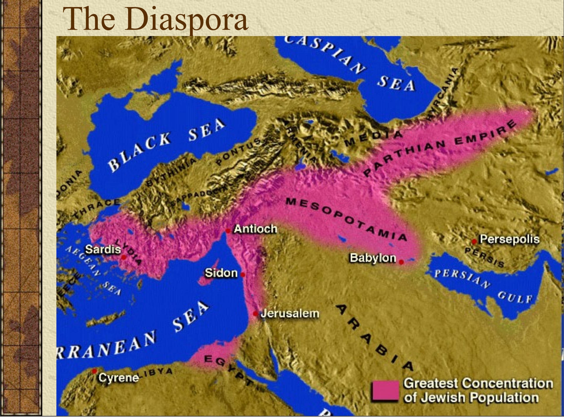
Friday, 21 December 12