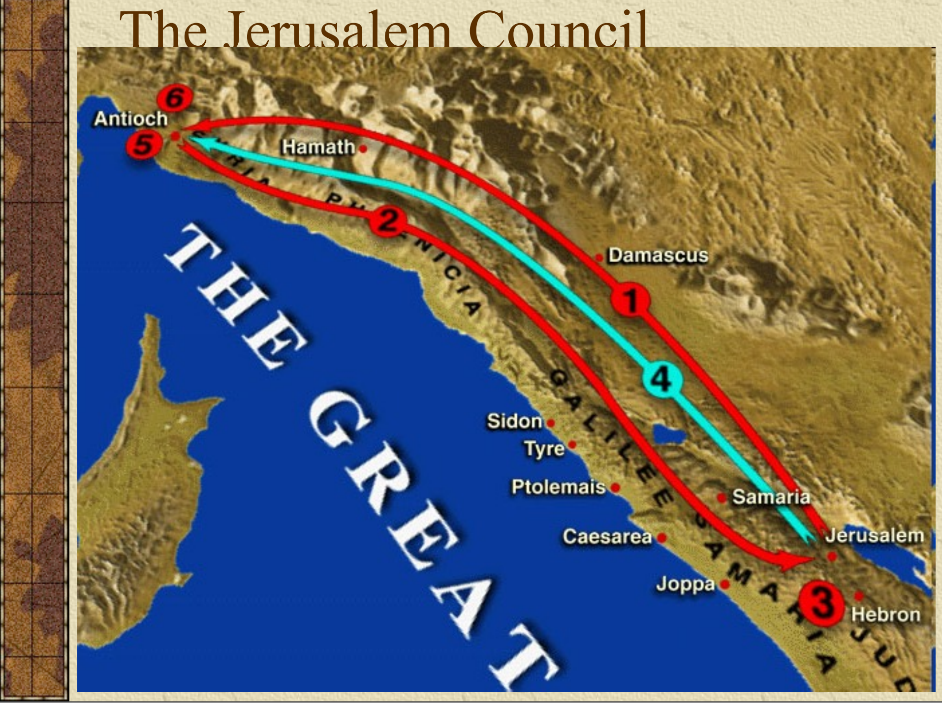
Friday, 21 December 12